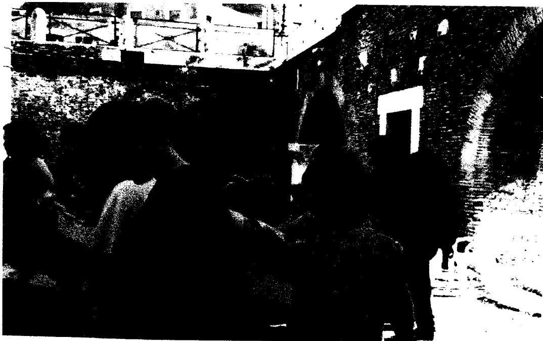
Forum of Trajan, Centro Group