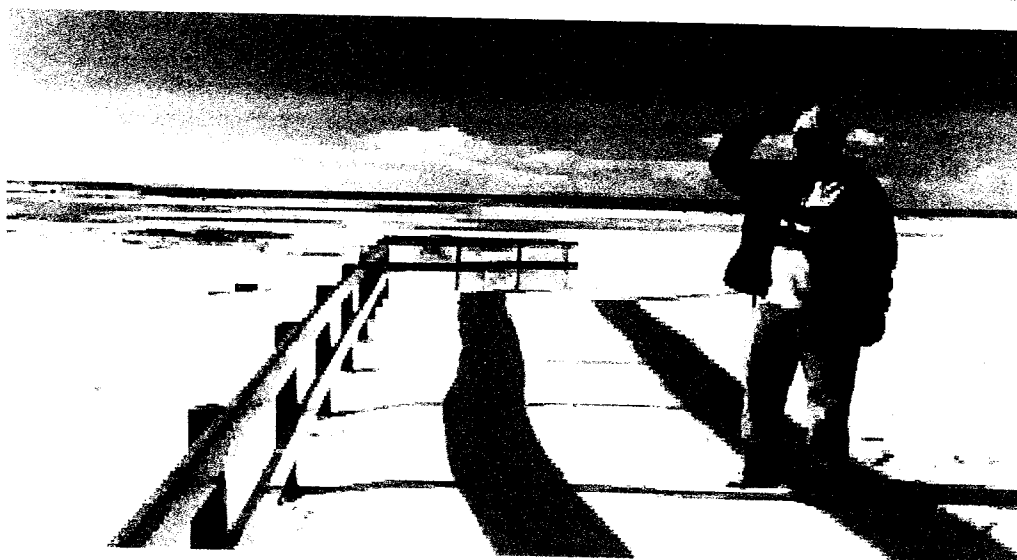
Myles McCallum looking down the Bay of Fundy toward Connecticut