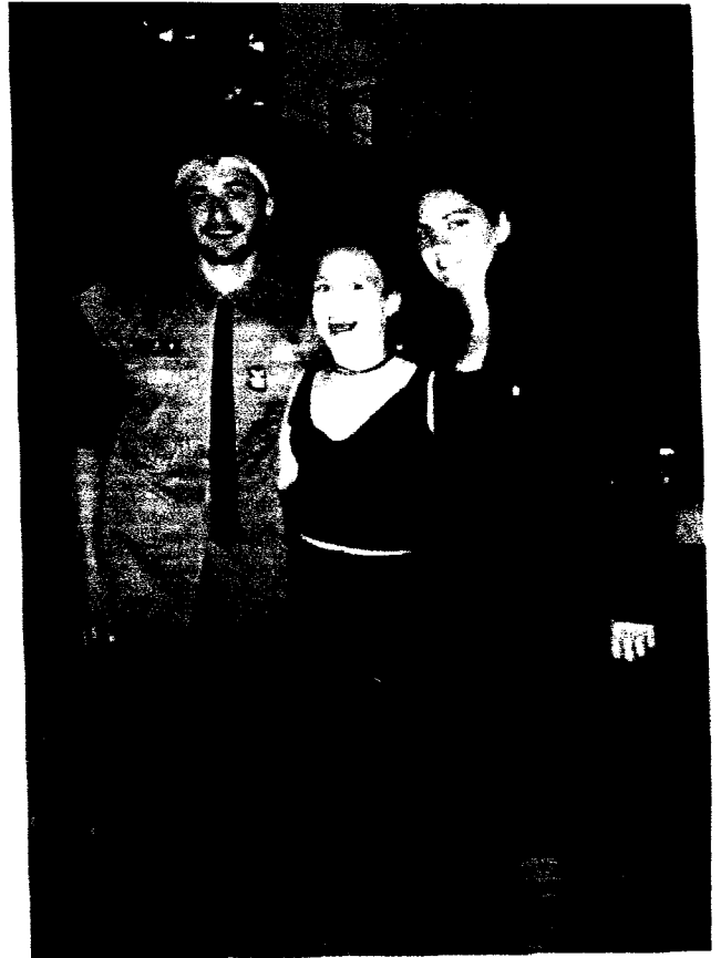
Centro Farewell Dinner